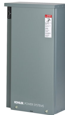
200 Amp with optional status indicator shown.